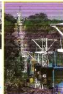
Above : Svetamber Jain Temple Nalanda